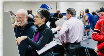
83rd & Lexington Study Open House

The consultants are now compiling all the collected data, including crash records, historical information, corridor characteristics, and public input, to develop their draft recommendation. This draft will be presented to the City Council in the next couple of months. Following this presentation, a final report will be prepared.